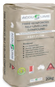
Self Levelling Compounds