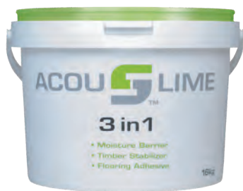
Acouslime 3 in 1

Acouslime the Complete Solution for Flooring Installations