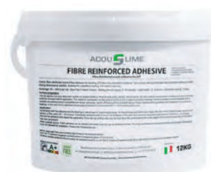
Fibre Reinforced Acrylic Adhesive