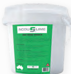
Bond Primers Moisture Seals