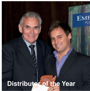
Distributor of the Year