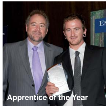
Apprentice of the Year